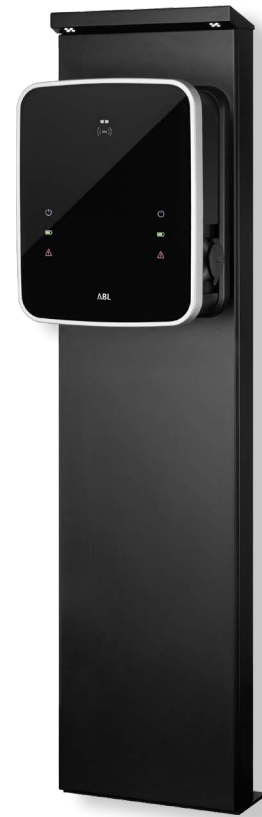
Separately available eMH3 Wallbox not included.

The STEMH30 mounting pole is designed for the outdoor installation of all ABL eMH3 Wallboxes. The STEMH30 model's winning features are its pleasant and compact metal housing design and the rear housing access protecting the internal components. The integrated LEDs with twilight sensor at the top end ensure sufficient illumination of the Wallbox, even in difficult lighting conditions. The installation of a suitable back-up fuse (2 A, 1-pole, C-characteristic) for the integrated power supply unit is recommended. For maximum stability, ABL recommends installing the STEMH30 on the optionally available EMH9999 prefabricated concrete foundation.