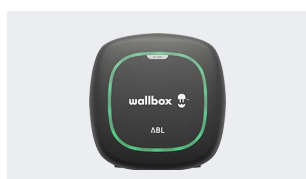
Wallbox ABL Pulsar