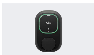
Wallbox ABL Pulsar Pro (Socket)