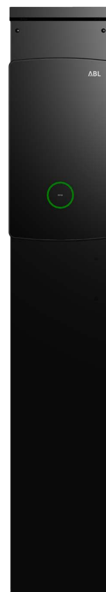
Separately available Wallbox eM4 Single not included

The POLEM4 Single mounting pole is used for mounting a Wallbox eMH1 (with or without WHEMH10, 1W0001 or PVEMH10 mounting plate), eMH2 or eM4 Single from ABL. The POLEM4 Single impresses with its attractive and compact metal housing, including rear access protecting the internal components. The mounting pole is fully pre-installed with integrated terminal blocks. An additional, free top-hat rail is pre-mounted for further installations and a C-rail is provided for strain relief of the supply cable. The charging pole is colour coordinated (RAL 9011) with the weather shield WPR12 and the cable storage holder CABHOLD, blending harmoniously into the overall look of the charge point. Thanks to the factory-fitted threaded bolts covered with blind plugs, no subsequent drilling is necessary. The LEDs with twilight switch integrated at the top end ensure sufficient illumination of the wallbox, even in difficult lighting conditions. For maximum stability, ABL recommends installing the mounting pole on the optionally available pre-fabricated concrete foundation EMH9999.