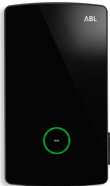
Product number 100000157

The robust design and high-quality workmanship of the Wallbox eM4 Single protect it from external influences. The wallbox comes pre-installed and ready for connection thanks to an integrated Type A RCCB and DC residual current detection. All ABL wallboxes are made in Germany and comply with the highest safety standards.