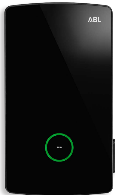
Product number 100000152

The robust design and high-quality workmanship of the Wallbox eM4 Single protect it from external influences. The wallbox comes pre-installed and ready for connection thanks to an integrated Type A RCCB and DC residual current detection. All ABL wallboxes are made in Germany and comply with the highest safety standards.