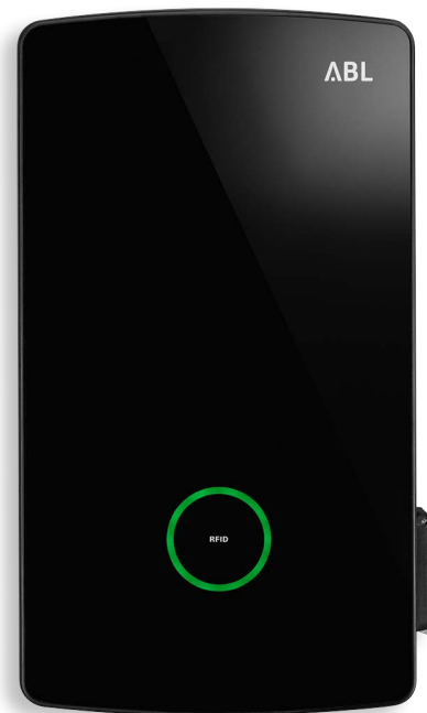
Product number 100000151

The robust design and high-quality workmanship of the Wallbox eM4 Single protect it from external influences. The wallbox comes pre-installed and ready for connection thanks to an integrated Type A RCCB and DC residual current detection. All ABL wallboxes are made in Germany and comply with the highest safety standards.