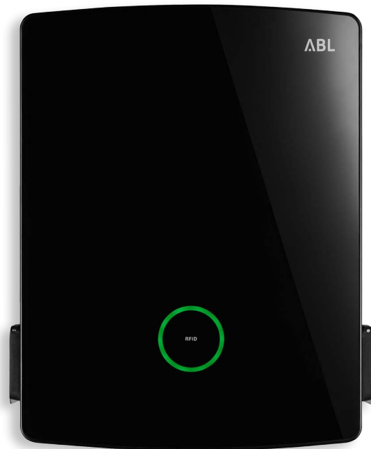
Product number 100000024

The robust design and high-quality workmanship of the Wallbox eM4 Twin protect it from external influences. The wallbox comes pre-installed and ready for connection thanks to the integrated Type A RCCB and DC residual current detection. All ABL wallboxes are made in Germany and comply with the highest safety standards.