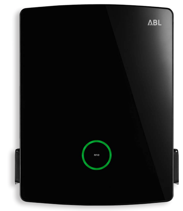
Product number 10000020

The robust design and high-quality workmanship of the Wallbox eM4 Twin protect it from external influences. The wallbox comes pre-installed and ready for connection thanks to the integrated Type A RCCB and DC residual current detection. All ABL wallboxes are made in Germany and comply with the highest safety standards.